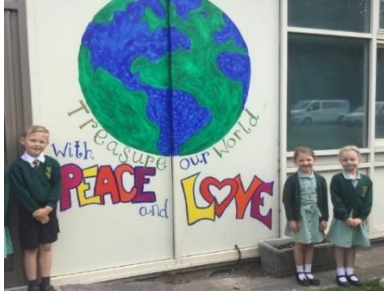
Iceni class at The Springhead Trust