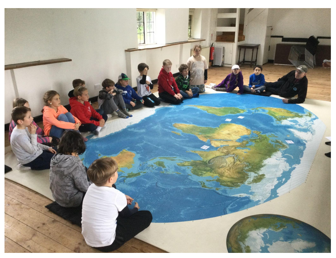
Locating and discussing the water and land on our planet.