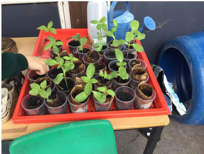
Maurward class have been growing sunflowers.