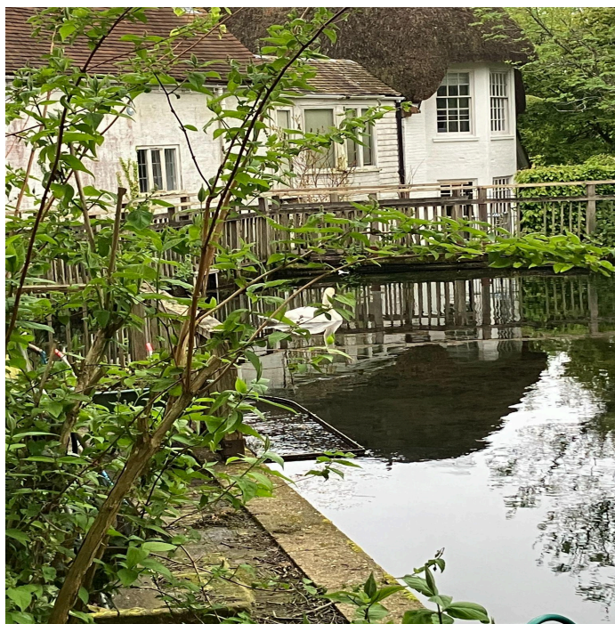
A swan enjoying the Springhead tranquility