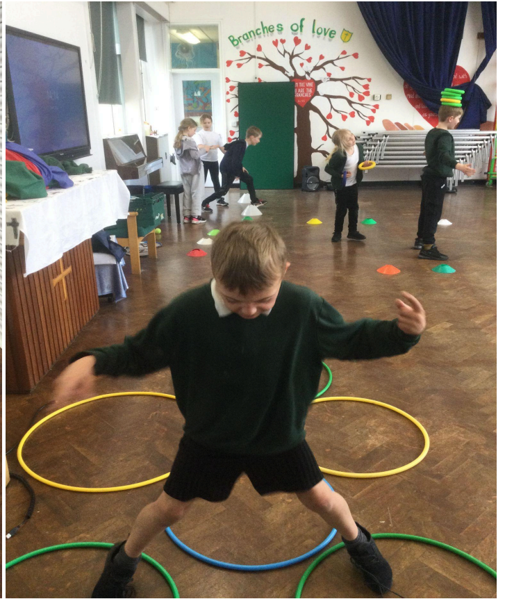
Maiden Class enjoyed completing an obstacle course this week, using many learned skills.